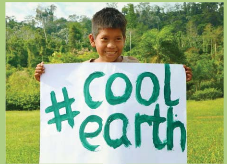
STRONGER FOREST VALUE

“INDIGENOUS COMMUNITIES CONSISTENTLY FACE THE HIGHEST THREAT FROM DEFORESTATION, YET, THROUGH COMMUNITY-LED MODELS, ACHIEVE THE GREATEST AVOIDANCE OF DEFORESTATION.”